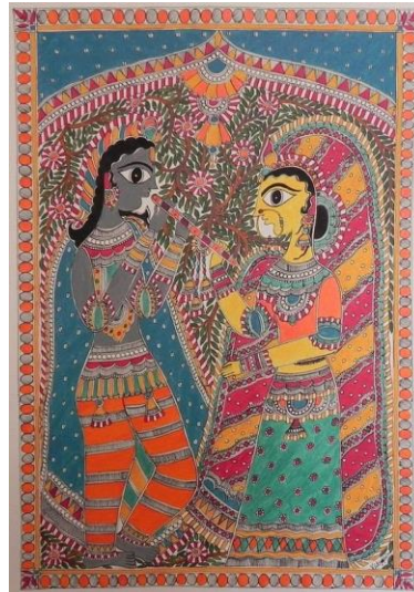
Figure (10): A painting of social celebrations in Madhubani

Tabl no (1): Shows how to read aesthetic values of Madhubani's paintings social theme in terms of design element of (line - color – composition):