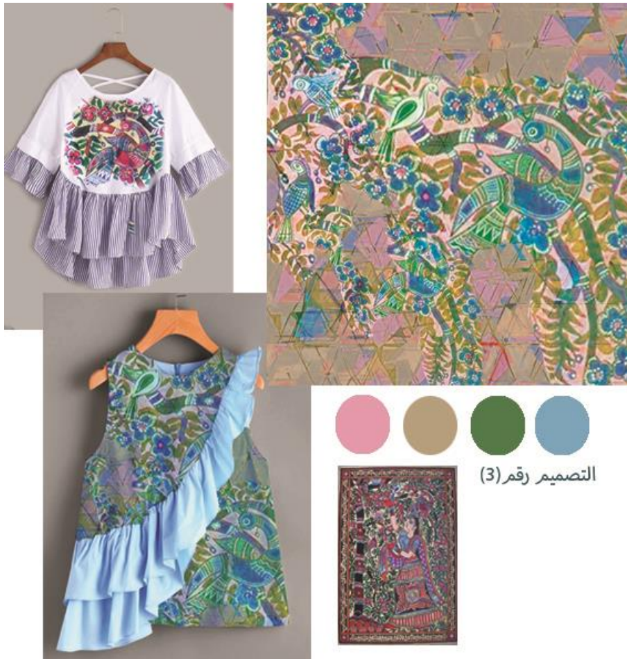
Fig (22): Madhubani’s art - Fig (23): Design idea no:3