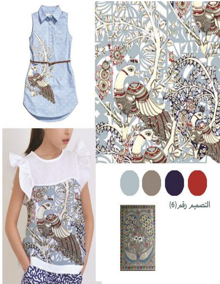
Fig (26): Madhubani's art - Fig (27): Designidea no:5