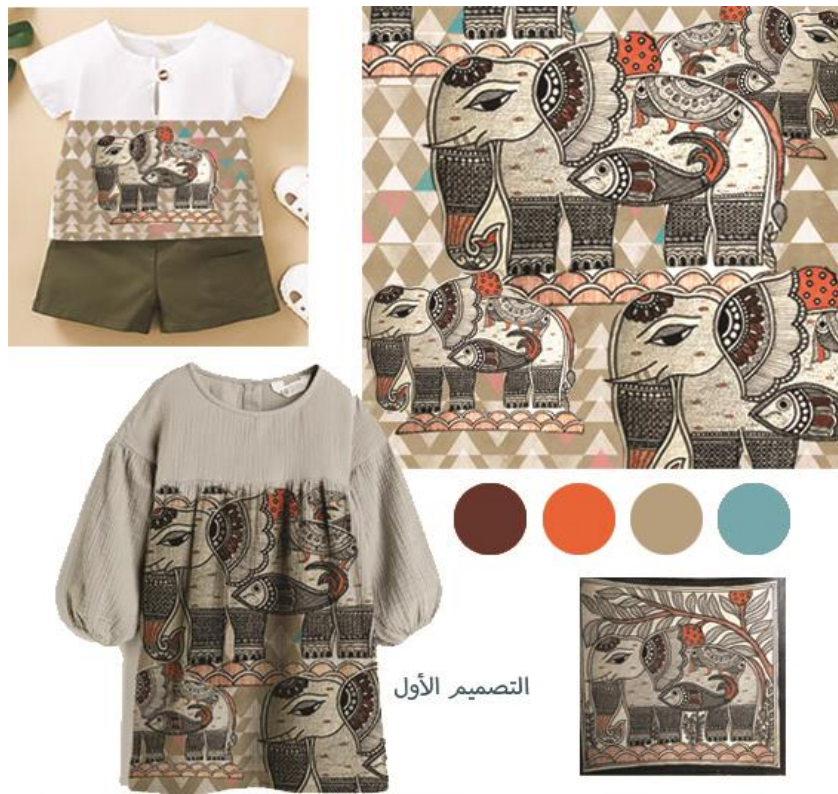
Fig (18): Madhubani's art - Fig (19): design idea no:1