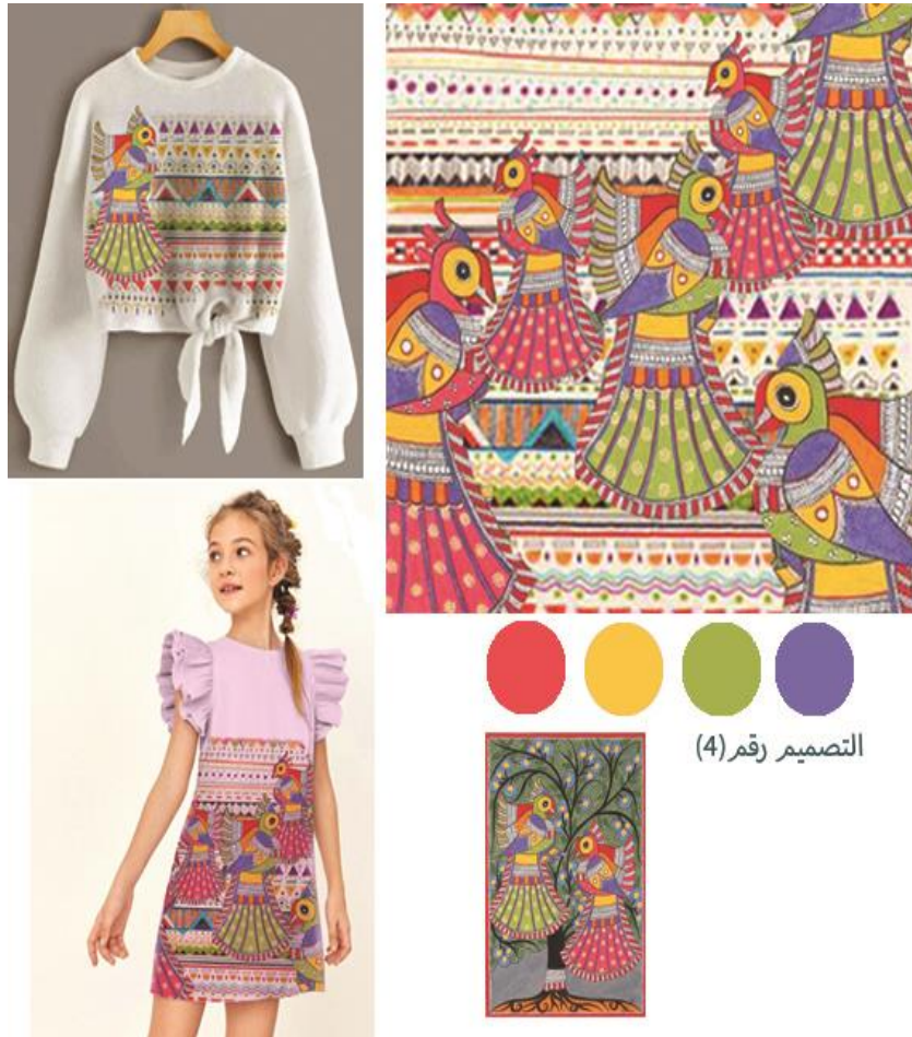
Fig (24): Madhubani’s art - Fig (25): design idea no:4