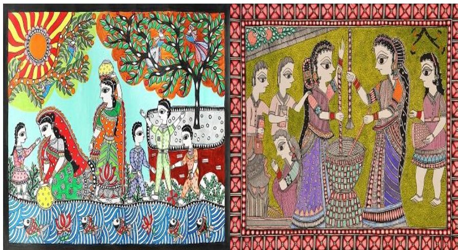
Figure (3) A scene of the countryside in the morning in Madhubani - Figure (4) A scene from one side of the daily life of Madhubani women

The Mithila region near the Indo-Nepalese border has been the seat of commercialization of folk art, allowing people from all over the world to discover this ancient folklore of women's lives and creating a new source of gainful employment in rural India for women and their families. The paintings on display include examples of several subjects of the flowery and symbolic style of painting in Madhubani such as the theme of social ceremonial occasions such as wedding and marriage; some major religious themes, in addition to scenes from the royal court, and the use of imagination in expressing themes that reflect the culture of this society inspired by the customs and traditions, political or religious events, feasts and celebrations, daily activities, Figure (3,4).