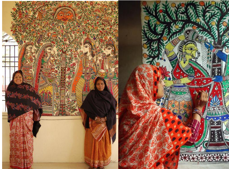
Figure: (1,2) Madhubani women with their drawings

Madhubani districts in North Bihar located at distance of 190 kilometers from Patna city where great cultural activities are practiced in a folk style by different folk artists, and it is an environment surrounded by lush green fields, tall palm trees and mango gardens in North Bihar. The unique village combines a wonderful natural and artistic beauty that embodies a creative atmosphere (Thakur, Upendra, 1964, p.6). This art which is done by a group of very simple housewives who do not go to any school to learn this painting, but rather from the inspiration of their traditions continuing from generation to generation, women express themselves through wonderful paintings created for all occasions. Women in the villages around Madhubani have been practicing this folk art for centuries, and about ninety-nine percent of the population of Madhubani district works in this field (Thakur Upendra, 1982, p.28). The Indian Madhubani created a place for itself in India and is becoming internationally famous and it is now recognized all over the world, and the Government of India is commending the initiation of programs to teach it.