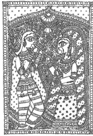
Figure No. (12) directions of lines in plate No. (10)

Central: It appears in the red arrows and refers to the two