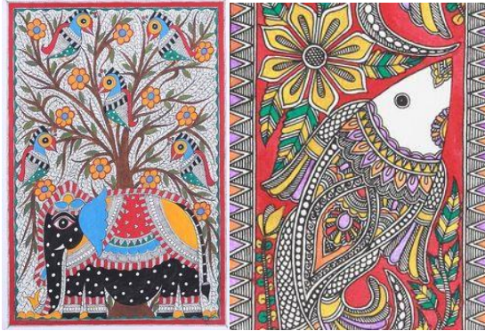
Figure (8,9) topics for elements of the environment, animals and fish

elements of his environment and transformed them into simplified symbols with delightful color details. Figure (8,9)