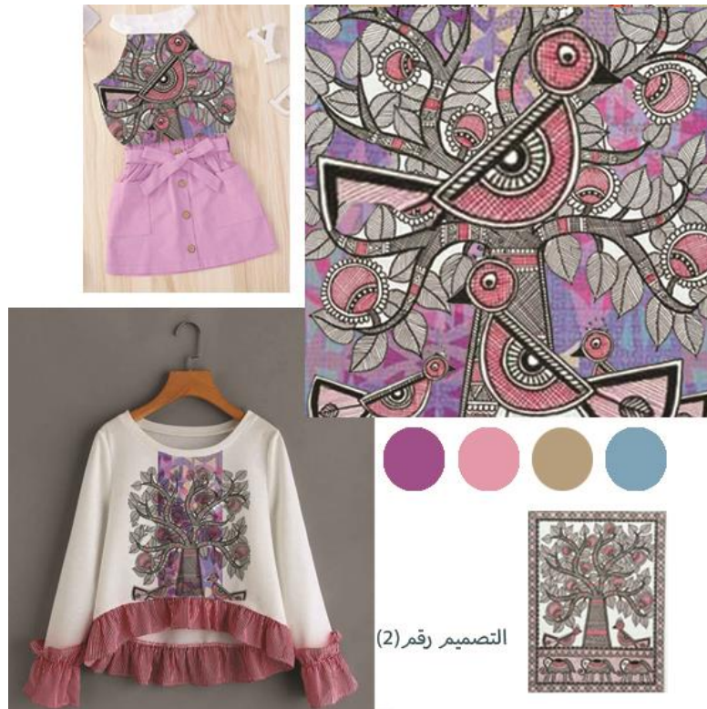
Fig (20): Madhubani’s art - Fig (21): design idea no:2