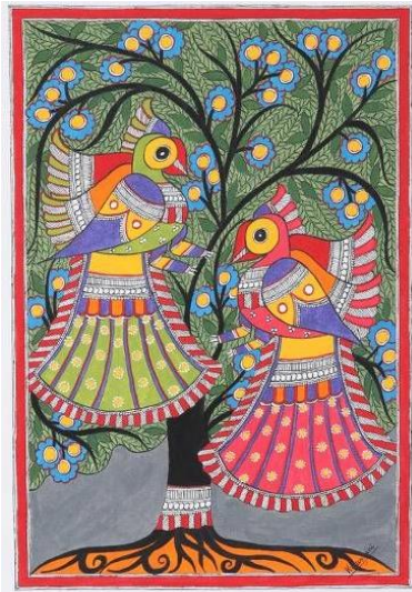
Figure (14): paintings of environment elements in Madhubani.