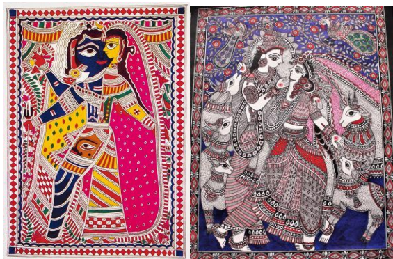
Fig:(5) social celebrations in Madhubani – Fig: (6) A scene from royal celebrations

Madhubani painting is usually painted on the walls during festivals, religious occasions and other milestones in the life cycle such as birth, upaniamam (sacred thread ceremony) and marriage. Madhubani's paintings mostly depict people and their association with nature such as the sun, the moon, and plants, along with scenes from the royal court and weddings. In these paintings, there is no empty space, but the gaps are filled with drawings of flowers, animals, birds, and even geometric designs. (Fig. 5,6) in which the harmony found in nature between animals, birds and plants.