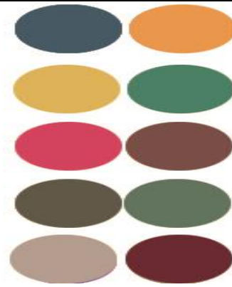
Figure No. (11) The colors in painting No. (10),

Lines: Vary throughout the painting to give the illusion of vitality and spread so that they cover all areas of the painting and all lines are flat to transform all figures into two-dimensional shapes and draw the side view of the two characters drawn. The abstract lines fig (12) indicates the variety of details and lines. The big black eyes and in painting (11) drawing the position of the movement of the hands holding some flowers in a narrative style as if it is a part of a narrative scene that tells the festive events of women. Abstract lines in fig.12 shows the diversity of the directions of the lines and the illusion of movement in the frame: Through the spread of wavy and slanted lines to