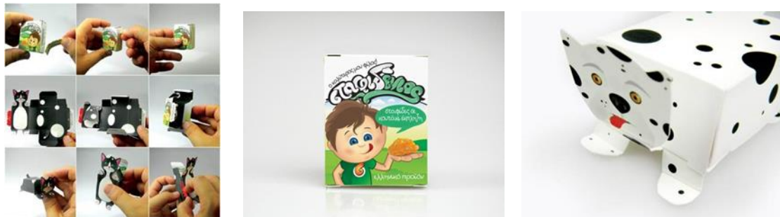
Figure (3) Stafidenios Raisins

In this section, the paper examines some selected samples of graphic design sustainability.