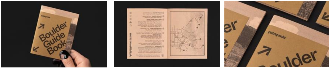
Figure (4) Patagonia http://www.re-nourish.com