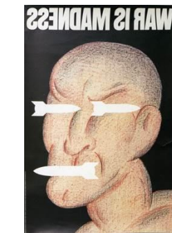
Seymour Chwast. End Bad