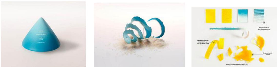
Figure (7) This Too Shall Pass, 2012. Rice package

As a result of donations from pack sales, Earth Greetings has helped Trees for Life plant more than 40,000 trees since 2008. On the packs and POS displays, the slogan "Every pack plant a tree" is prominently featured, and many customers claim they are inspired to purchase these cards in order to support the environment.