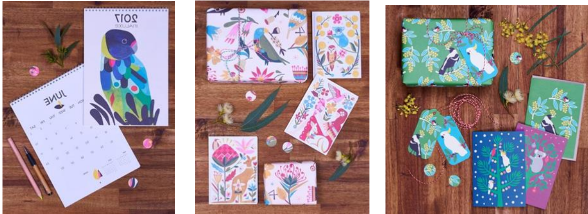
Figure (6) Earth Greetings Christmas Cards http://www.re-nourish.com

for the smaller home goods. Customers frequently decided to preserve the personalized "My Story" that came with their furniture since they really enjoyed it.