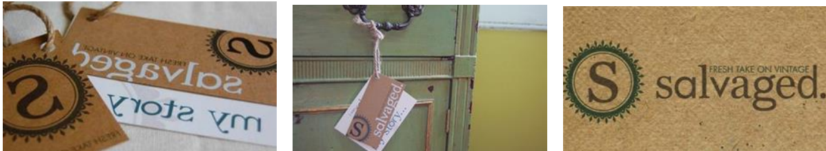
Figure (5) Salvaged http://www.re-nourish.com

A business called Living Ink has been creating algae-based pigments since 2013. 8,000 booklets were produced on one of our favorite 100% PCW recycled papers after a successful test run. Despite being a relatively insignificant victory of itself, yet this one helps the industry move toward a more sustainable future.