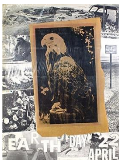
Robert Rauschenberg, Earth Day 1970

Bierut and Friedman considered that most graphic designers were associated with their activism during World War II and the 1970s' first environmental movement. (Bierut and Friedman, et al 2006). Figure (1).