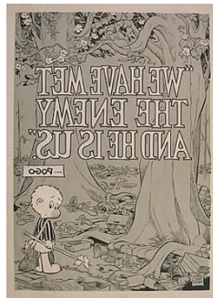
Walt Kelly, Earth Day 1970